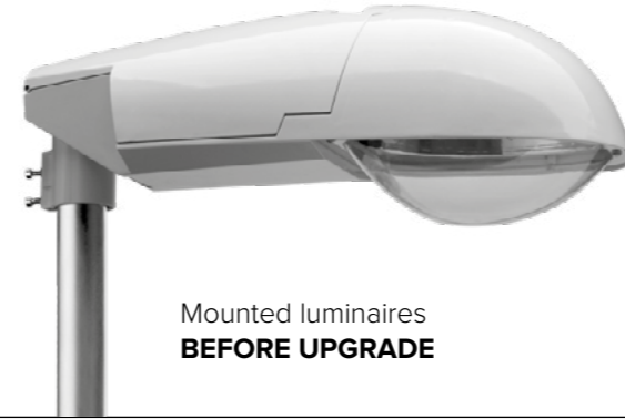
Mounted luminaires BEFORE UPGRADE

Replacing sodium vapour road lamps with modern LED lamps with a control system is not only a matter of aesthetics, ecology and comfort, but above all – savings . Thanks to this investment, the city will use over 50% less electricity annually and will save almost 8400 EUR a year. Over the period of 30 years (i.e. the service life of the new lighting), the investment will bring savings of over 252 222 EUR!