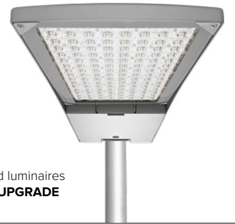
Mounted luminaires AFTER UPGRADE

168 W sodium vapour lamp – 161 pieces 279 W sodium vapour lamp – 13 pieces