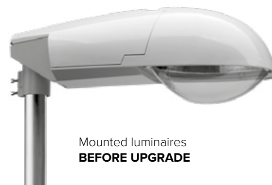
Mounted luminaires BEFORE UPGRADE

Replacing sodium vapour road lamps with modern LED lamps with a control system is not only a matter of aesthetics, ecology and comfort, but above all – savings . Thanks to this investment, the city will use over 50% less electricity annually and will save almost 8400 EUR a year. Over the period of 30 years (i.e. the service life of the new lighting), the investment will bring savings of over 252 222 EUR!