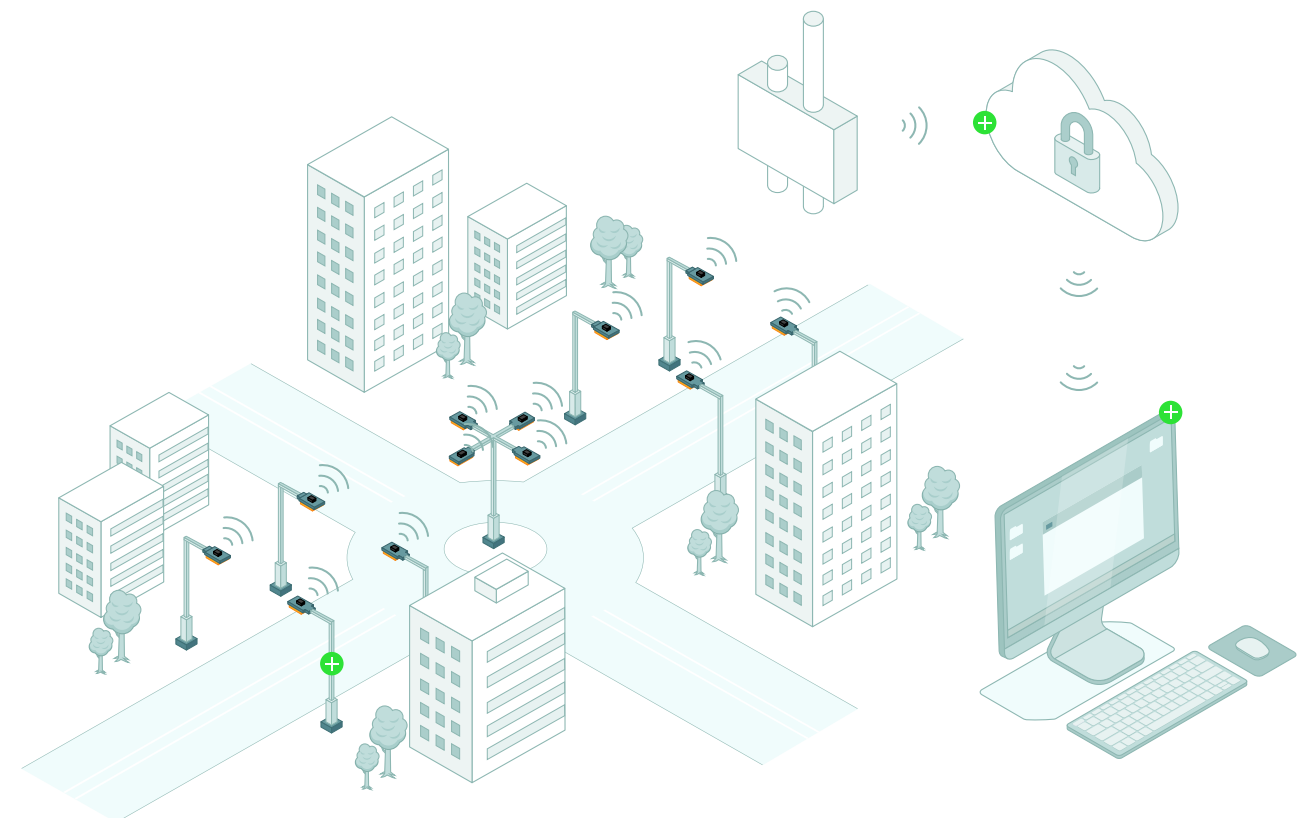
CLUE CITY operating diagram. Two-way communication and lighting management.