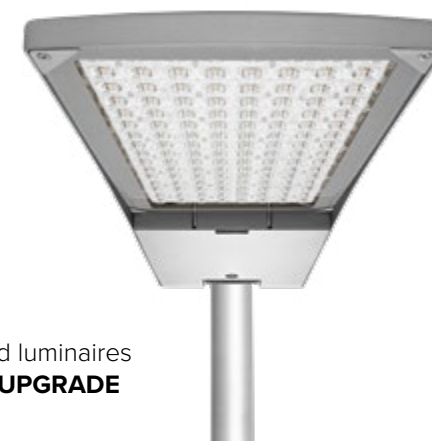
Mounted luminaires AFTER UPGRADE

168 W sodium vapour lamp – 161 pieces 279 W sodium vapour lamp – 13 pieces